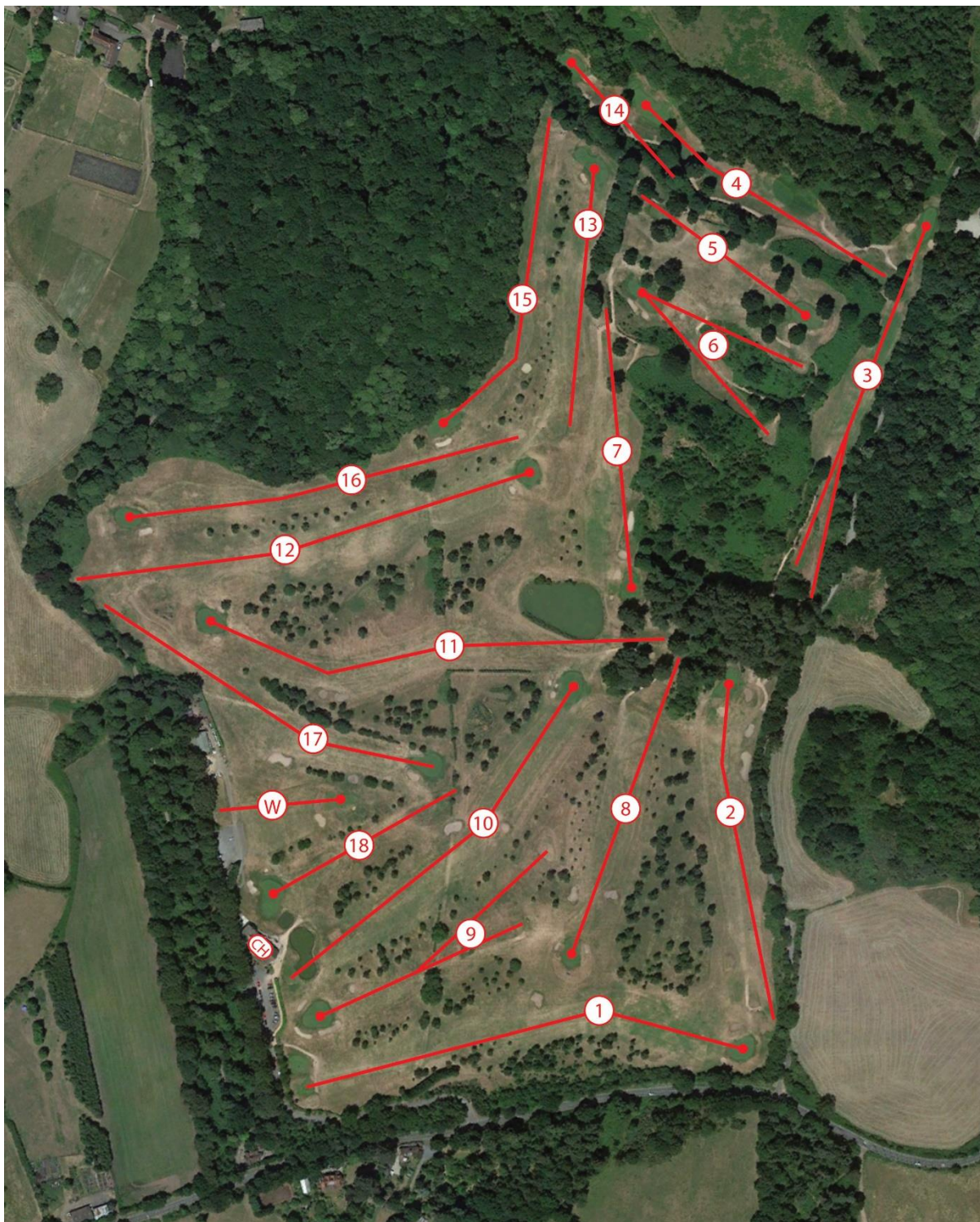
Bewdley Pines Golf Club Course Layout

Winter course omits 14 th hole, holes 15 to 18 become 14 to 17 with hole W winter 18 th .